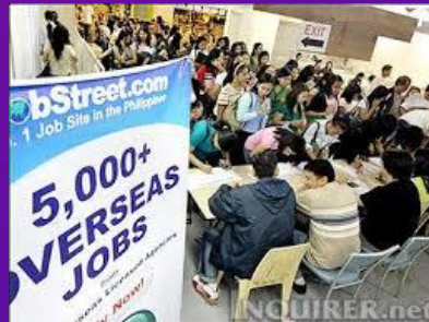
Annual Report of OFW Deployment, POEA