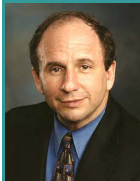
Sen. Paul Wellstone

A few days later Paul delighted in the fact that his vote resulted in a surge of support among Minnesotans, a surge that almost certainly would have led to his reelection.