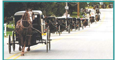
Amish Funeral Procession

I believe that God also didn't want us to miss the response of reconciliation and mercy that has come forth from a community of people who have chosen to be removed from the world in order